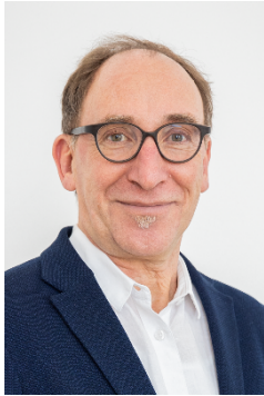
Johannes Rauch